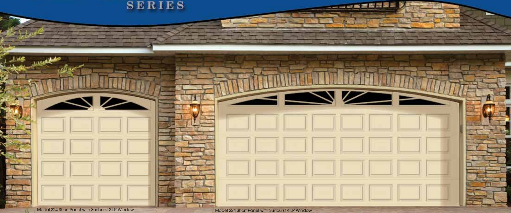
Model 224 Short Panel with Sunburst 2 LP Window