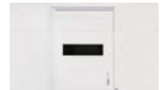
32" wide x 80" high (.81 m x 2.3 m), max 16'2" (4.9 m) wide section.