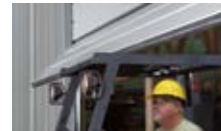
Single section and double sections available on select sizes.