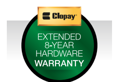
Upgrade your standard door with industrial-grade components.