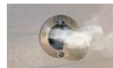
Can be cut into any type of sectional door. Available in select sizes.