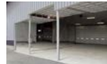
Carry-away, roll-away or swing-up mullions are available on select sizes.