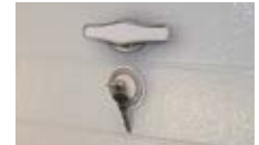
Outside keyed lock