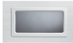
24" X 12" INSULATED GLASS Available with either a black or white frame.